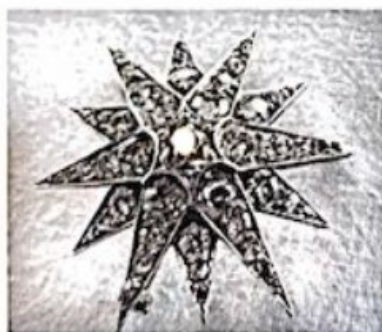
Victorian diamond star brooch