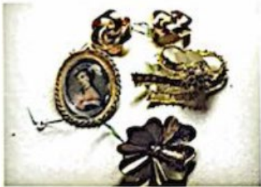
Various yellow gold brooches (nothing of singular value over £800) 41.2 grammes gross