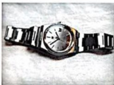
Gentleman's Tissot Seastar stainless steel wristwatch silver baton numeral dial with date aperture and integrated strap Case 35mm diameter