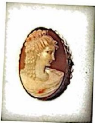
Mid 20th Century Italian carved shell cameo brooch depicting head and shoulder profile portrait of a woman with ringlet hair, within a yellow precious metal mount, stamped '9ct' 55mm x 40mm, 17.4 grammes