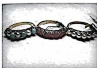
Aggregate value for the following items: