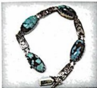
Turquoise matrix cabochon set line bracelet rectangular pierced design spacer links in 9ct yellow gold, oval cabochons 18mm by 9mm, 185mm long Hallmarks for Birmingham, sponsor's mark S&Co 14.9 grammes