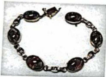
Moss agate line bracelet collet set with six oval agate cabochons, fancy link spacers, each cabochon 14mm by 9mm by 4mm approximately, 180mm long 9ct gold assay marks for Birmingham 1941 16.3 grammes