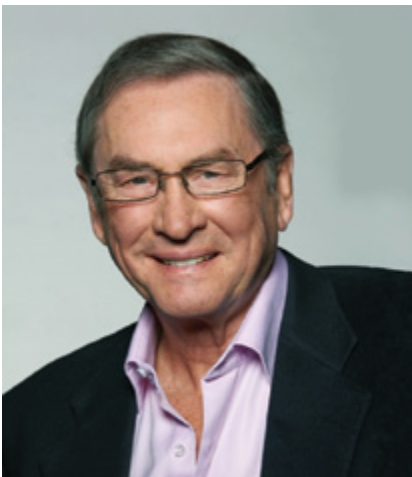
Lord Ashcroft KCMG PC Founder and Chair of Crimestoppers

Welcome to the 7th edition of Crimestoppers' Connections, where we reflect on the charity's recent achievements and offer those who champion our services an opportunity to share their stories.